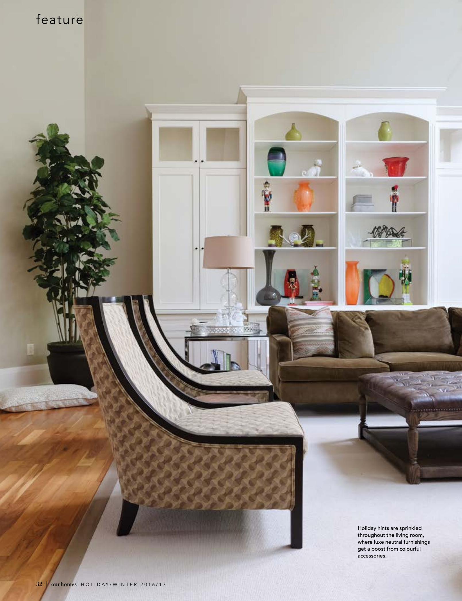
Holiday hints are sprinkled throughout the living room, where luxe neutral furnishings get a boost from colourful accessories.